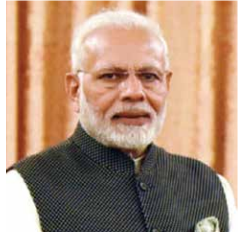
Prime Minister, Narendra Modi

Forbes said Modi “remains hugely popular” in the second most populous country on earth.